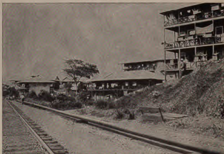
Along the P. R. R. in New Gatun